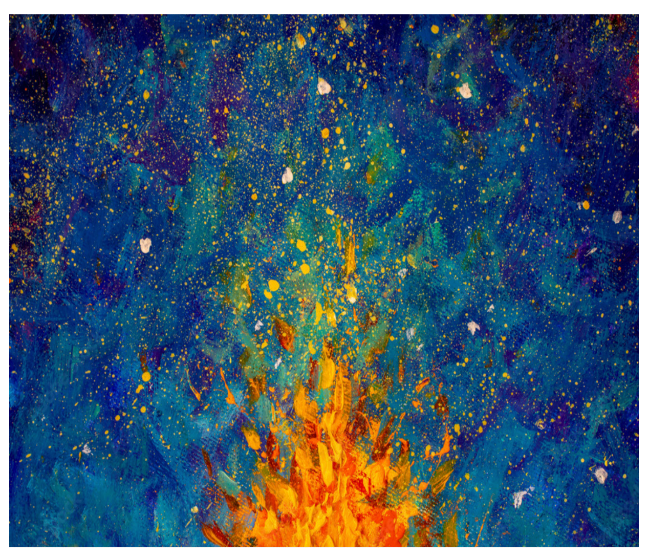
Eternal Flame Unknown