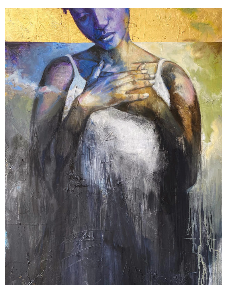
My Burden is Light Eva Crawford