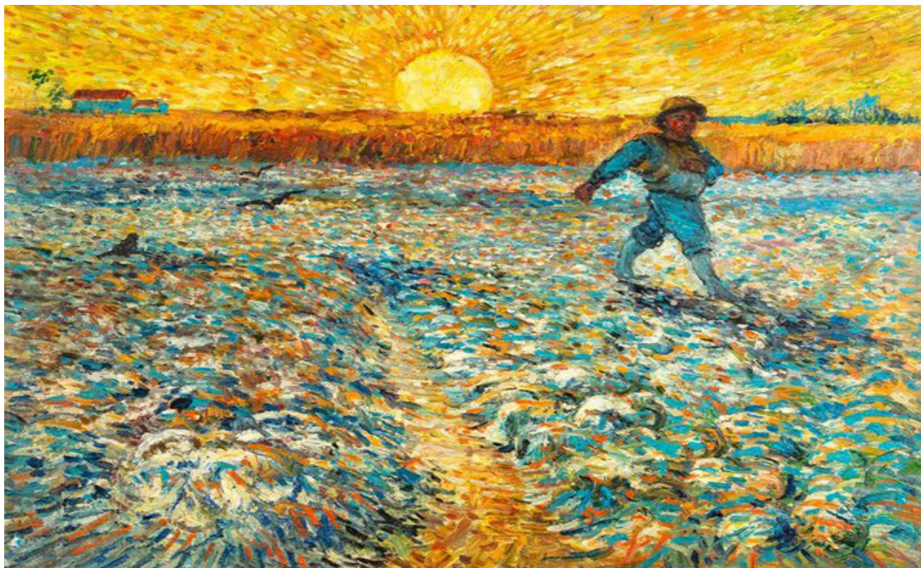
The Sower Vincent van Gogh

Seventh Sunday after Pentecost July 16, 2023 | 10:00 am Worship Service