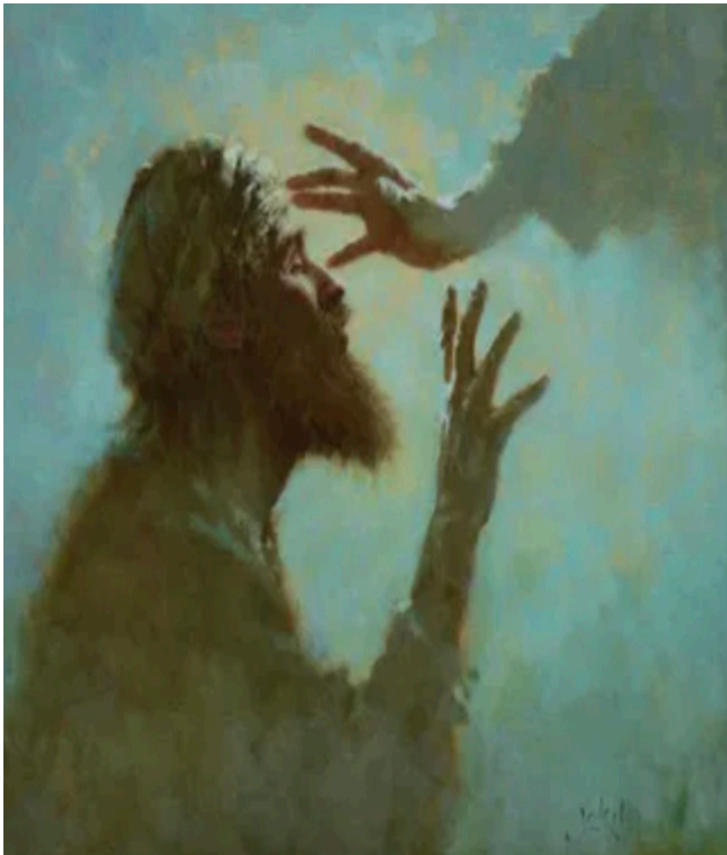
Jesus healing the Blind Man, 2008