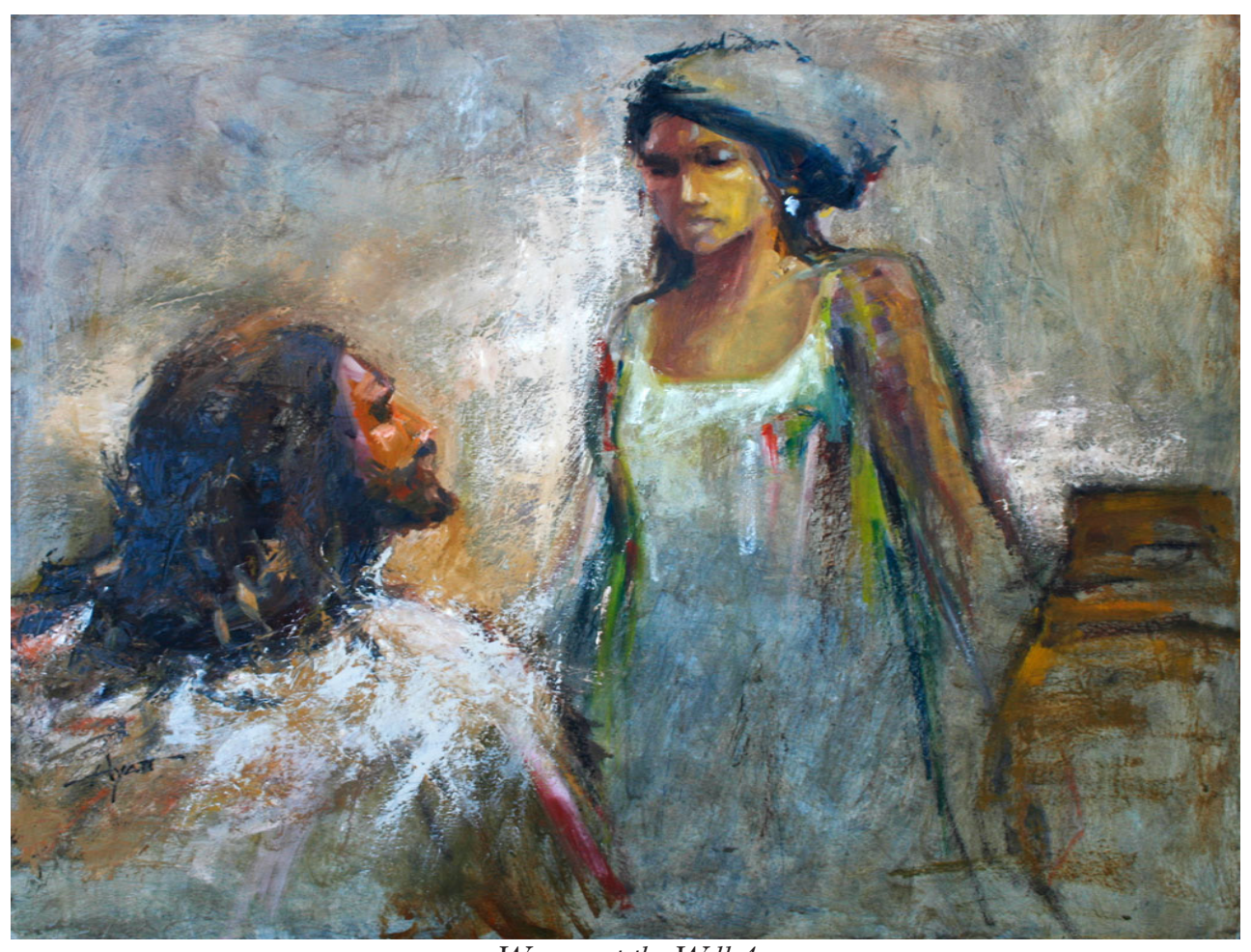
Woman at the Well 4 Hyatt Moore