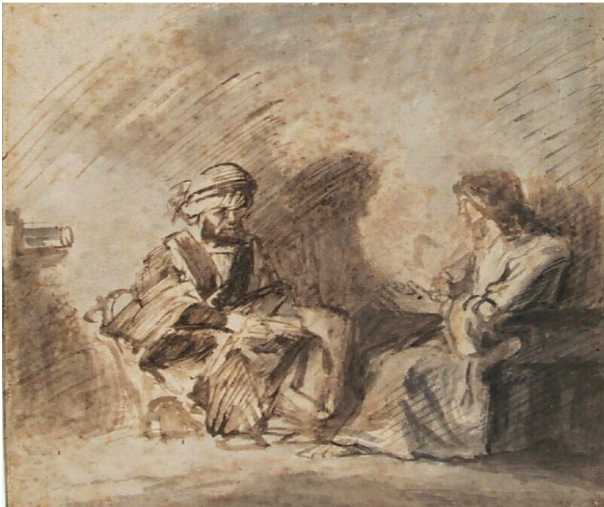
Christ and Nicodemus Anoniem