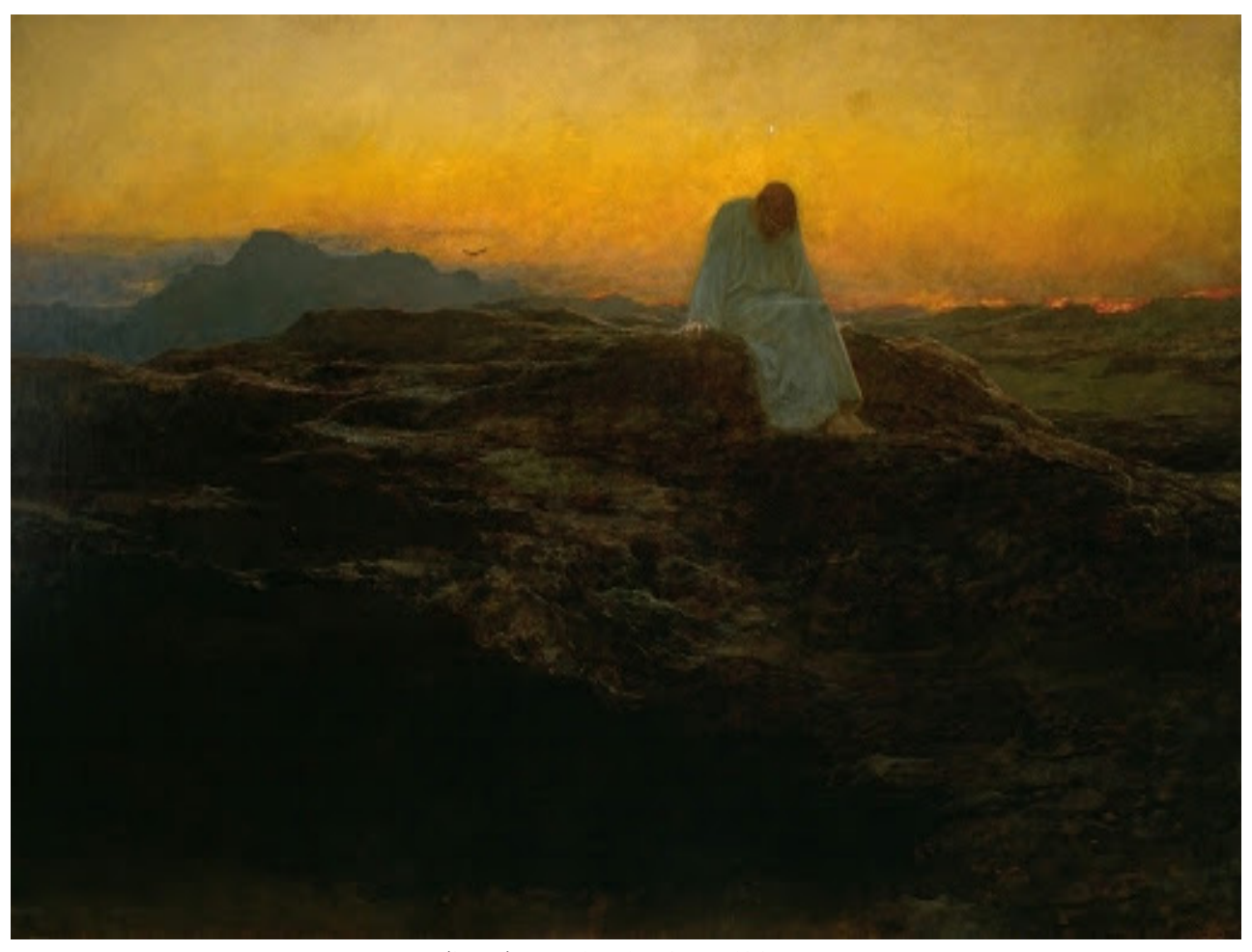
The Temptation in the Wilderness Briton Rivière