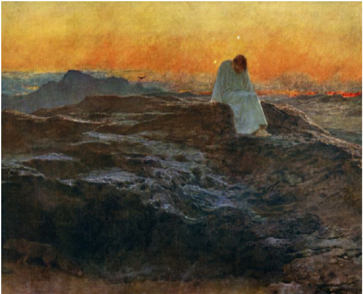
Christ in the Wilderness', 1898