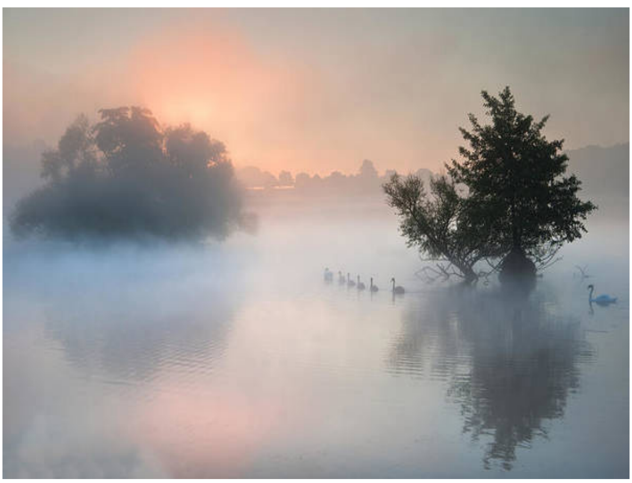
Bevy Herd of Swans on Misty Foggy Autumn Fall Lake

Transfiguration of the Lord February 19, 2023 | 10:30 am Worship Service