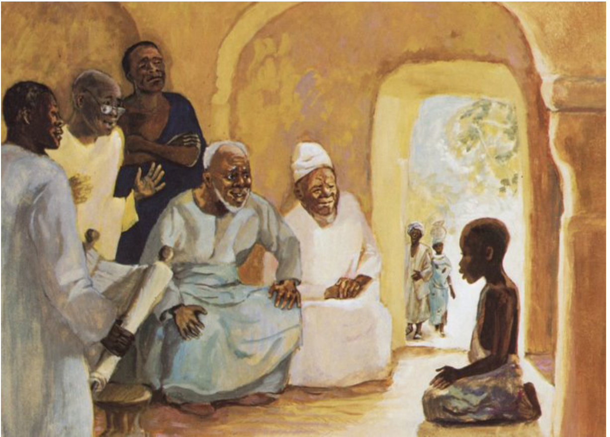
“Jesus Among the Teachers” Jesus Mafa