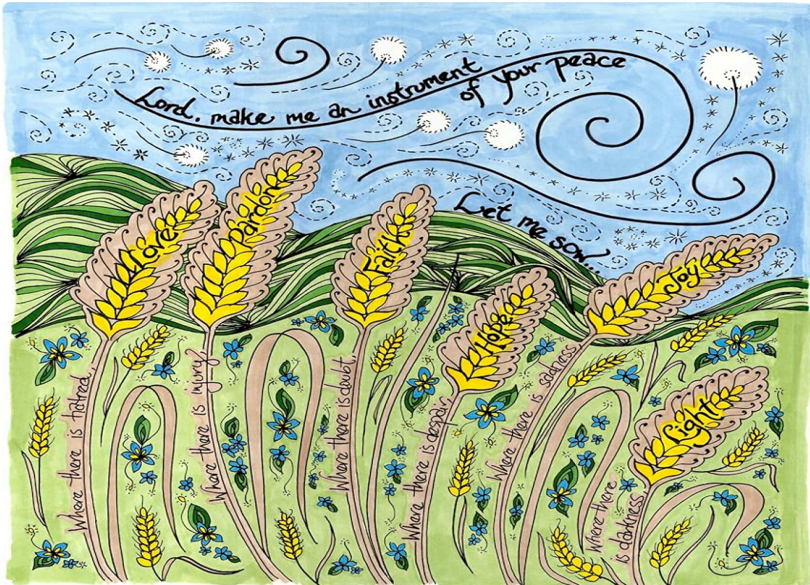
Prayer of St Francis

Twenty Fifth Sunday after Pentecost November 19, 2023 | 10:30 am Worship Service