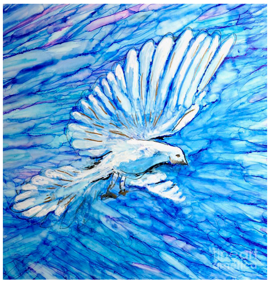
Blue Dove Holy Spirit Patty Donoghue